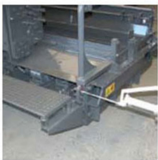
▲For asphalt finishers.