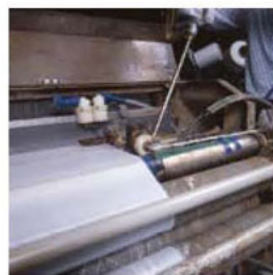
▲For machines exposed to water splashes. (water jet bearings)