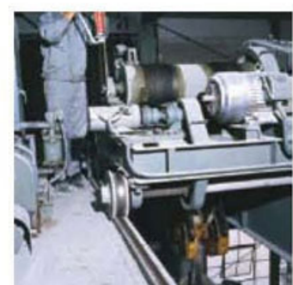
▲For standardization of lubricants on factory floors.