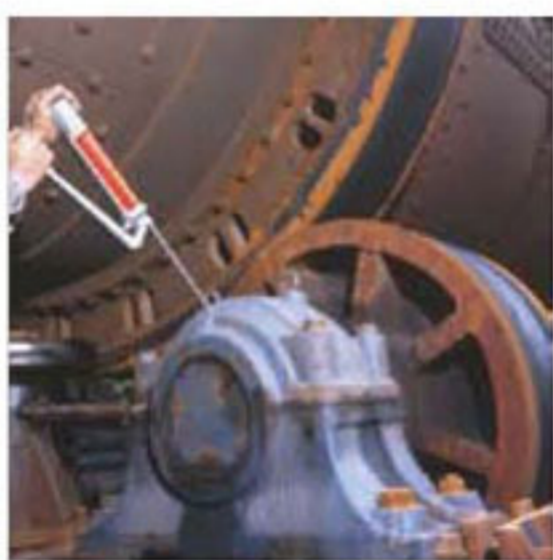
▲For bearings in rotary kilns. (cement plants)