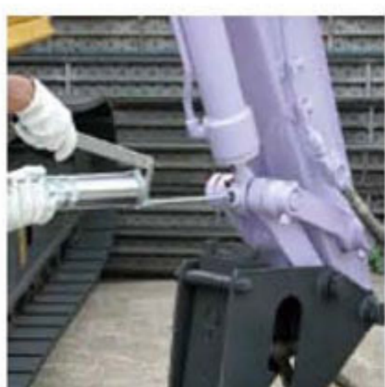
▲For standardization of lubricants at construction sites.